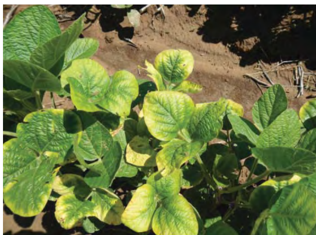
Figure 5-6. Potassium deficiency – advanced symptoms.

If K deficiencies occur prior to early seed development (before R5) or if K fertilizer was not applied, K fertilizer may still be applied and watered in with prompt irrigation or a timely rain. Significant yield increases can be achieved from mid- to late-season K fertilization. The trifoliolate leaf nutrient concentrations shown in Table 5-7 can be used as a guide to interpret soybean leaf analysis. Arkansas research shows that leaf K concentrations >1.80% at the