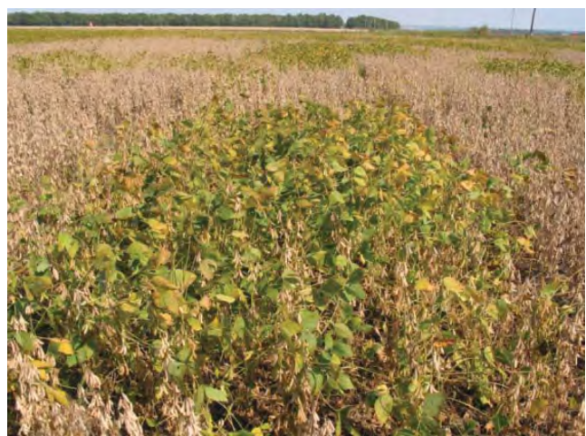
Figure 5-11. Boron deficiency – delayed maturity (leaf retention) as a result of boron deficiency.