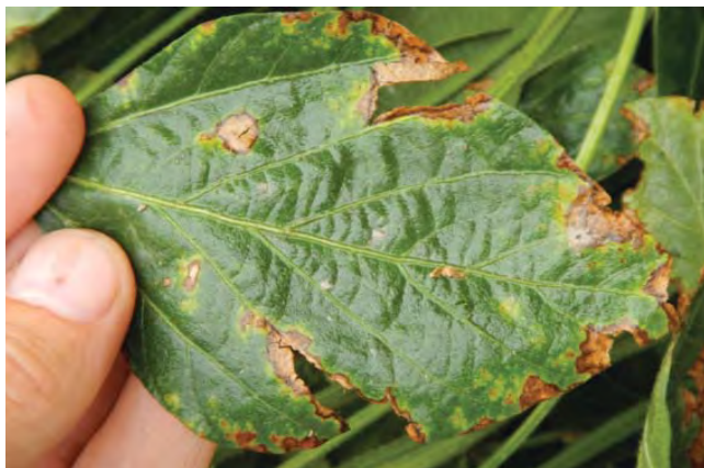
Figure 5-17. Boron toxicity – symptoms of boron toxicity on lower soybean leaves.

field experience with this problem in Arkansas suggests that only subtle symptoms are expressed on plants with B concentrations of 100 to 150 ppm B and the severity of symptoms increase when plants have greater leaf B concentrations. Boron toxicity is most likely to occur on soils with below optimal pH (<6.0) and moderate to high soil test B (Mehlich 3 > 2.5 ppm).