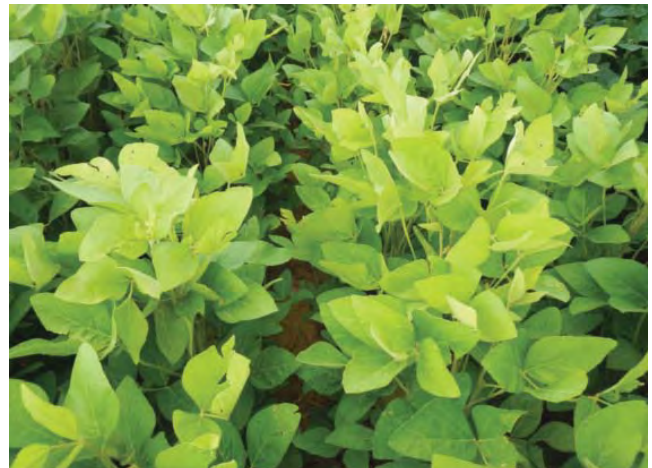
Figure 5-2. Nitrogen deficiency – closeup of N-deficient soybeans.

N deficiency caused by insufficient Mo or lack of the N-fixing rhizobia in the soil. Ammonium and sodium molybdate are water-soluble fertilizers that can be foliar applied in the case that a Mo deficiency is diagnosed.