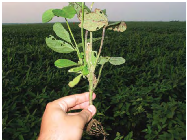
Figure 5-9. Boron deficiency – stunted plant with regrowth (branching) from lower node.