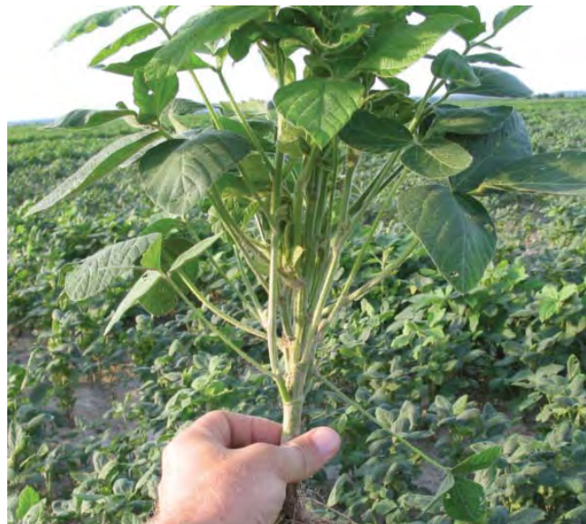
Figure 5-10. Boron deficiency – plant recovering from deficiency (note multiple branches from lower node).