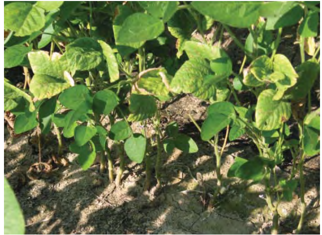
Figure 5-24. Chloride injury – mottled and scorched leaves.