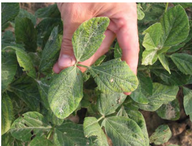
Figure 5-8. Boron deficiency – leaf appearance after prolonged boron deficiency.

Symptoms of B deficiency may be evident shortly after emergence or in the late reproductive growth stages, but symptoms are most commonly observed during mid- to late-vegetative growth (e.g., V6 to early bloom) after the first irrigation (Figure 5-8 through 5-15). The symptoms of B deficiency may include leaf cupping, stunting (i.e., short internodes), swollen nodes, leaf malformation that may resemble phenoxy herbicide injury, leaf chlorosis and, when severe, death of the terminal growing point. In its later stages, B-deficient soybean plants are short, the leaves become thick and dark green, retain their leaves longer than soybeans with sufficient B nutrition, have few pods and maturity is delayed.