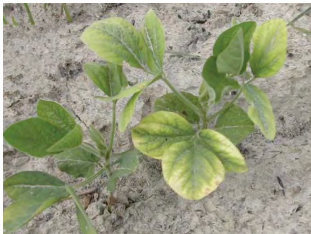
Figure 5-5. Potassium deficiency – early-season symptoms on double-cropped soybeans (note dry soil condition).

along the leaf margin (Fig. 5-5 and 5-6). The amount of the leaf that is chlorotic increases as the duration and severity of K deficiency increases. Potassium deficiency symptoms are often present on leaves in the middle and top of the plant. Observations made in commercial fields and research trials indicate that K deficiency symptoms in the youngest leaves are common. Symptoms that appear in the early season may indicate very low soil K availability, problems involving uptake of soil K (e.g., drought) or both. Early-season symptoms are common when soils become very dry or in areas with significant soil compaction.