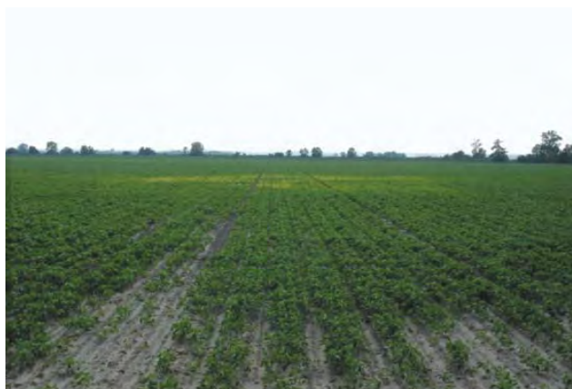
Figure 5-19. Manganese deficiency – hot spot (chlorotic area) in middle of field.