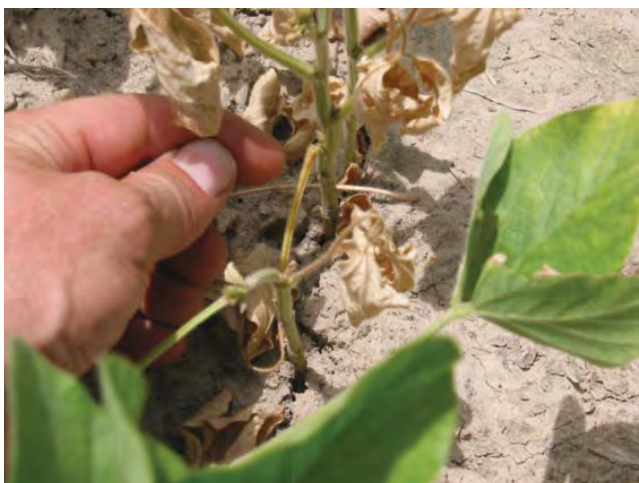
Figure 5-22. Chloride injury – dead soybean plant with detached petiole.