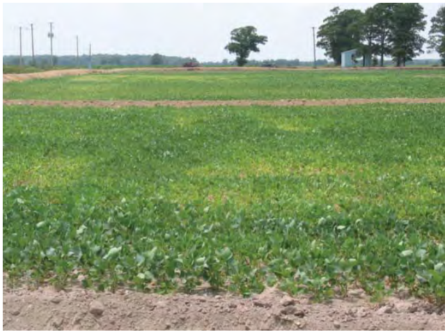
Figure 5-20. Chloride Injury – damage in low area.