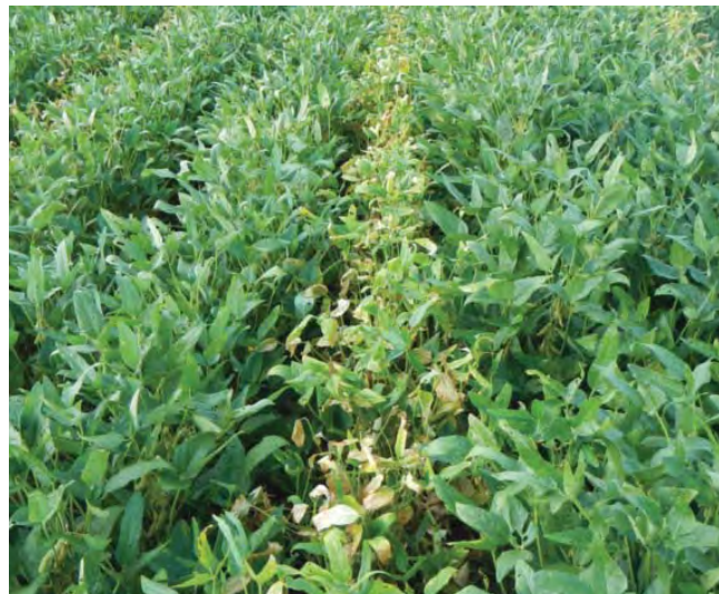
Figure 5-25. Chloride injury – middle rows of soybeans planted on beds suffering from Cl toxicity.