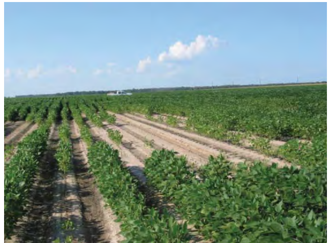
Figure 5-23. Chloride injury – Poor stand caused by chloride injury.