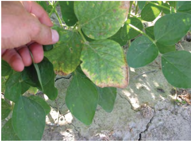
Figure 5-21. Chloride injury – scorching on margin of older leaves.