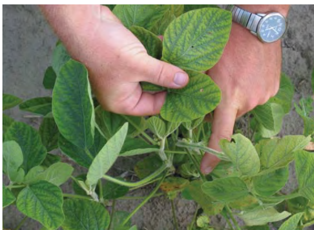
Figure 5-18. Manganese deficiency – interveinal chlorosis.

Limited soybean growth/yield response to Mn fertilization has been reported on some eastern Arkansas silty clay soils where soil-test Mn levels were below 10 ppm (20 lb/acre). Trifoliolate leaf Mn concentrations less than 20 ppm are considered deficient and have reliably confirmed foliar symptoms. The most common Mn deficiency symptom is an interveinal chlorosis of the uppermost leaves while the leaf veins remain green (Figure 5-18). Localized Mn-deficient areas in soybean fields will often have a yellow cast that is visible from a distance (e.g., edge of field, Figure 5-19). In states where Mn deficiency of soybean is a consistent problem, the standard recommendation is to apply 0.25 to 0.5 lb Mn/acre to soybean foliage. Manganese fertilizer should not be tank-mixed with glyphosate as the efficacy of the glyphosate may be substantially reduced. The amount of antagonism that occurs in a tank-mixture of Mn fertilizer and glyphosate varies among Mn fertilizers, but as a general rule, fertilizers containing Mn-EDTA are least antagonistic. When Mn is actually deficient, 0.2 to 0.5 lb Mn/acre should be applied 7 to 10 days after the glyphosate.