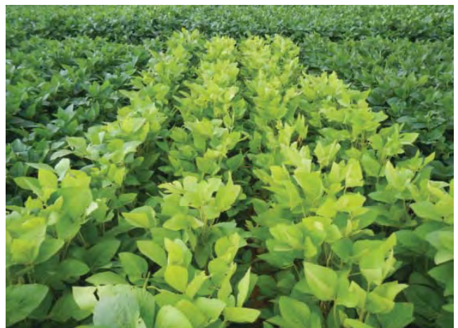
Figure 5-3. Nitrogen deficiency – non-nodulating soybeans receiving no N surrounded by nodulating soybeans.