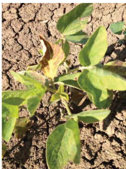
Figure 5-7. Phosphorus deficiency – stunted plant with reddish interveinal coloration of lower leaves.

Phosphorus deficiency of soybeans occurs much less frequently than K deficiency. The deficiency symptoms exhibited by P-deficient soybean plants are usually subtle in that the plants have small leaves and an overall unthrifty appearance. In some instances, P-deficient plants may exhibit an interveinal reddening on the lower leaves (Fig. 5-7).